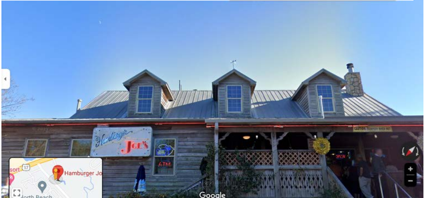
Hamburger Joe's in North Myrtle Beach ranks as the best place to get cheeseburgers in South Carolina.